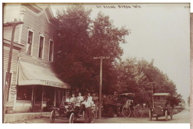
Figure 1 George Tice General Store, later known as Luedtke's