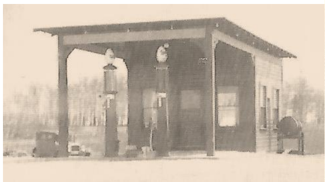
Figure 3 Hesprich gas station circa 1932, 964 Milwaukee St. Figure 4 Strobel's Campsite