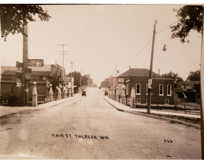
Figure 6 Approaching bridge from north. Ford sign on left